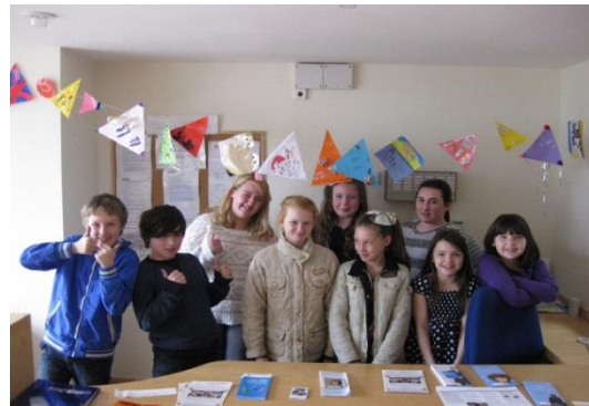
The Bridge Young Carers group art day

Agenda Days are held that are led by young people and focus on the key issues affecting them.