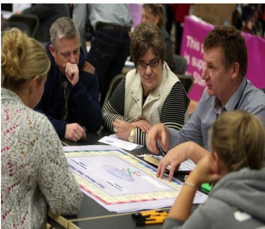
AAP consultation event

Further work will take place at a local level through Area Action Partnerships and will be progressed through the Community Wellbeing Partnership, which is a sub-group of the Health and Wellbeing Board.