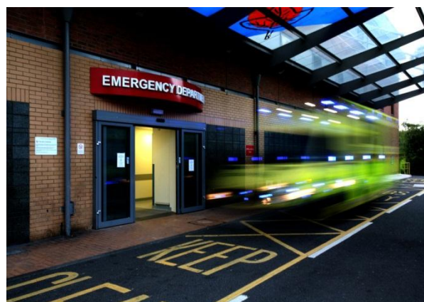
University Hospital North Durham A&E department

Regular consultation on key strategies and service developments also takes place with Adults, Wellbeing and Health and Children and Young People's Scrutiny Committees. Regular updates on key issues are also provided to Scrutiny Committees.