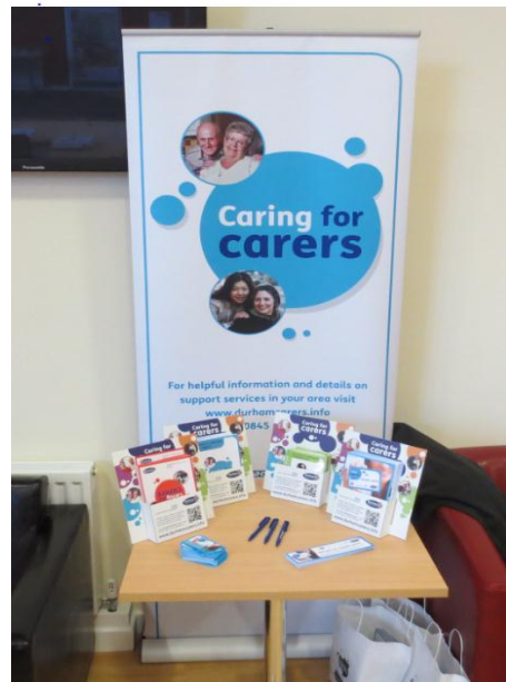
Big Tent Engagement Event

Feedback from the Peer Challenge stated that County Durham's Health and Wellbeing Board is in a very strong place.