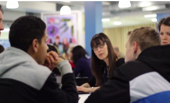
IIC Agenda Day

This is particularly notable as the Peer Challenge team's feedback report states that the 'voice of the child' is not well developed across the country.