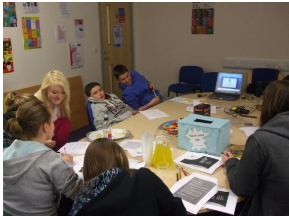
Investing in Children Agenda Day

Agenda Days are held that are led by young people and focus on the key issues affecting them.